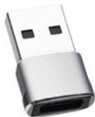
USB-A to USB-C Converter for conventional USB plugs.

The Vac Pro comes with a wide variety of attachments engineered for different use cases.