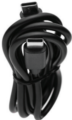
USB-C Cable Standard 3ft cable. Charge and power your VAC Pro.